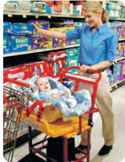
As shown with the Baby Board Attachment option

Shopper's Aid™ by Mart Cart® is a quality product line of Assembled Products™ Corp.